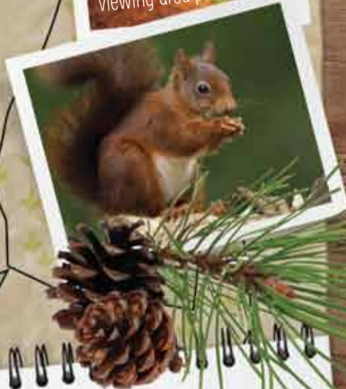
viewing area path

The trail passes very close to houses, so please be considerate if you are using binoculars or cameras.