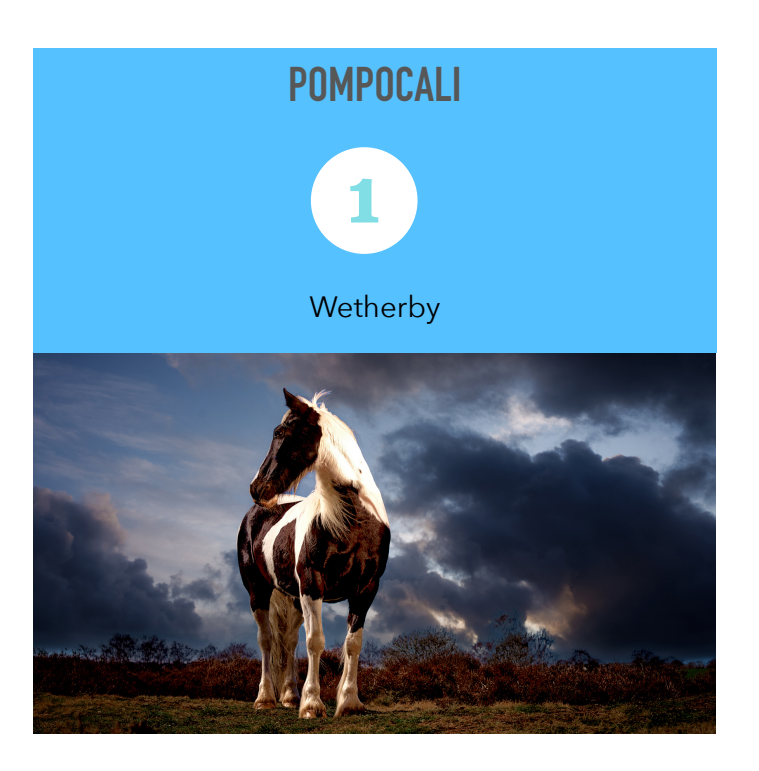
Pompocali, Milner Ln, Wetherby, LS14 3AQ

Pompocali is a strange series of earth workings situated between Thorner and Bardsey near to Hetchell Woods, not far from the A58. This location is great for horse portraits with big sky's if that is the style you are looking for.