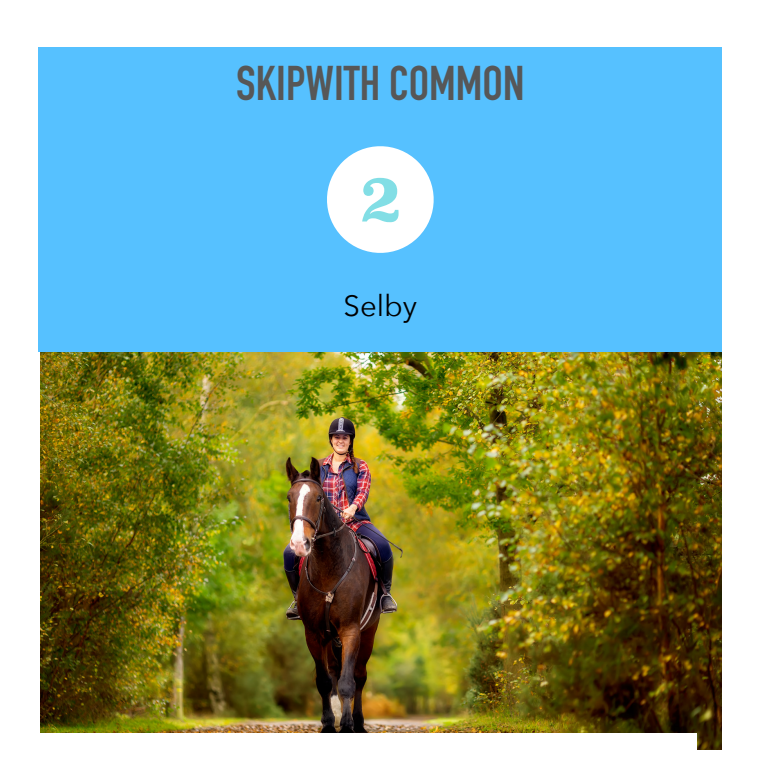
Skipwith Common: Way To Bomber Loops, Cornelius Causeway, Selby YO8 5DD

The banks of the earth workings form almost horse shoes type shapes with conical mounds and ridges that can provide some dramatic horse portraits. There are various marked bridleways that criss cross the area and the woodland area in the autumn provide additional backgrounds for horse portraits styles.